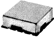
CASE STYLE: DV874